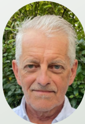
Mayor Dennis Helmuth